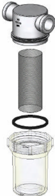
Exploded View—Parts Kits Not Available

Catalog: MS-030-140 / MS-03083 Warranty: 1 Year Limited SB-1041 / SB-1050